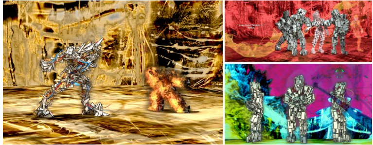
David and Goliath Still can't Fight, Venus and Her Muses, Sometimes Up, Sometimes Down