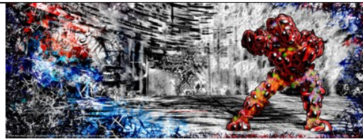
Floodplain, Digital Painting